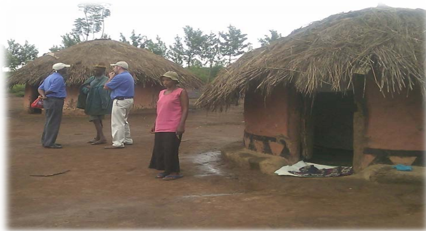
The above figures are Nyakatsi sample houses in Bugesera district

At the end of their Global Convention, Members of Diaspora got time to tour rural communities in Bugesera district and to visit over 500 disadvantaged families below the poverty line (almost 3000 people) living in grass thatched houses and sheets of banana trees. Their living situation is really lamentable.